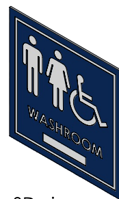
3D view code 966