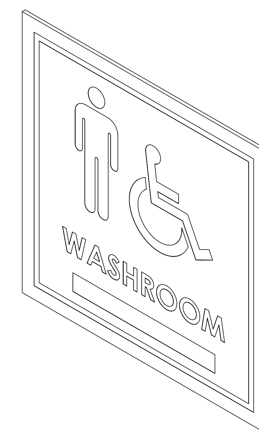
3D view code 962

PROPRIETARY AND CONFIDENTIAL THE INFORMATION CONTAINED IN THIS DRAWING IS THE SOLE PROPERTY OF FROST PRODUCTS LTD. ANY REPRODUCTION IN PART OR AS A WHOLE WITHOUT THE WRITTEN PERMISSION OF FROST PRODUCTS LTD. IS PROHIBITED.